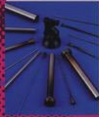
頂針燒結情況 Ejector Pins Affected By "Burn Effect"

你有模具 行位、扣位、頂針、鑲件燒 Did You Have Burn In Mould parts 的問題嗎? Problem?